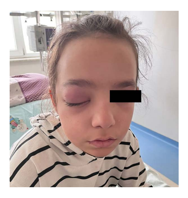
Figure 1. Edema and hyperemia in the right eye

A 12-year-old girl patient with no known disease was admitted with complaints of swelling, redness, burning and pain in the right eye for a day. Amoxicillin clavulanate treatment at a dose of 40 mg/kg/day had been started to the patient at an another health center with the diagnosis of sinusitis. Two days after the onset of symptoms, the patient presented with fever, swelling, pain, and a burning sensation localized to the right eye. On physical examination, body temperature was 36.9 °C, heart rate was 114/min and blood pressure was 100/60 mmHg. There was edema as much as to close the eyelid opening, hyperemia and temperature increase in the right eyelid (Figure 1). Eye movements were free in all directions. Visual acuity was found %100 bilaterally by ophthalmologic examination. There was purulent postnasal