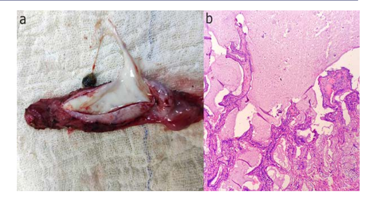
Figure 1. a: Gallbladder containing mucoid material and 14 mm diameter stone (macroscopy of the first case), b: Mucoid material in the lumen, flattened epithelial-lined surface and local inflammatory cell infiltration (microscopy of the first case) (H&E,x40).

The first case was a 26-year-old woman, who applied to the clinic for complaints of nausea, vomiting, flatulence, indigestion, and pain in the epigastric region and the rightupper quadrant. Having pain in the epigastric region and the right upper quadrant occasionally for approx. 2-3 years, the patient stated that she had indigestion, flatulence, and gas problem especially after eating very greasy foods. The patients, who intermittently experienced nausea and vomiting after the pain, has applied to many healthcare facilities for these complaints. The patient has never had jaundice and, after the severity of complaints increased and back pain was added, she applied to the polyclinic. On physical examination, bowel sounds were normoactive, and sensitivity was detected in the right-upper quadrant and epigastric region in the palpation. No rebound, defense, or organomegaly was found, traube was open and Murphy's sign was observed. Then, in abdominal USG, it was determined that the gallbladder wall was normal and there was a 14-mm-diameter stone and sludge in the gallbladder lumen. The patient was hospitalized